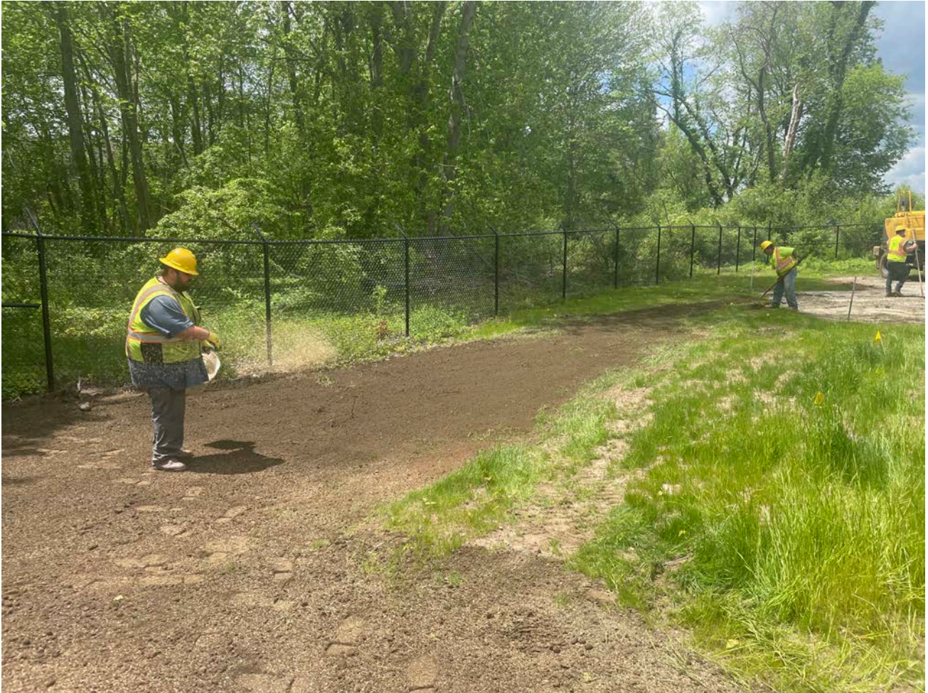
Picture 7: Ludlow placing grass see over freshly placed and raked loam on the southeast corner of the Booster Station. View to the southwest.