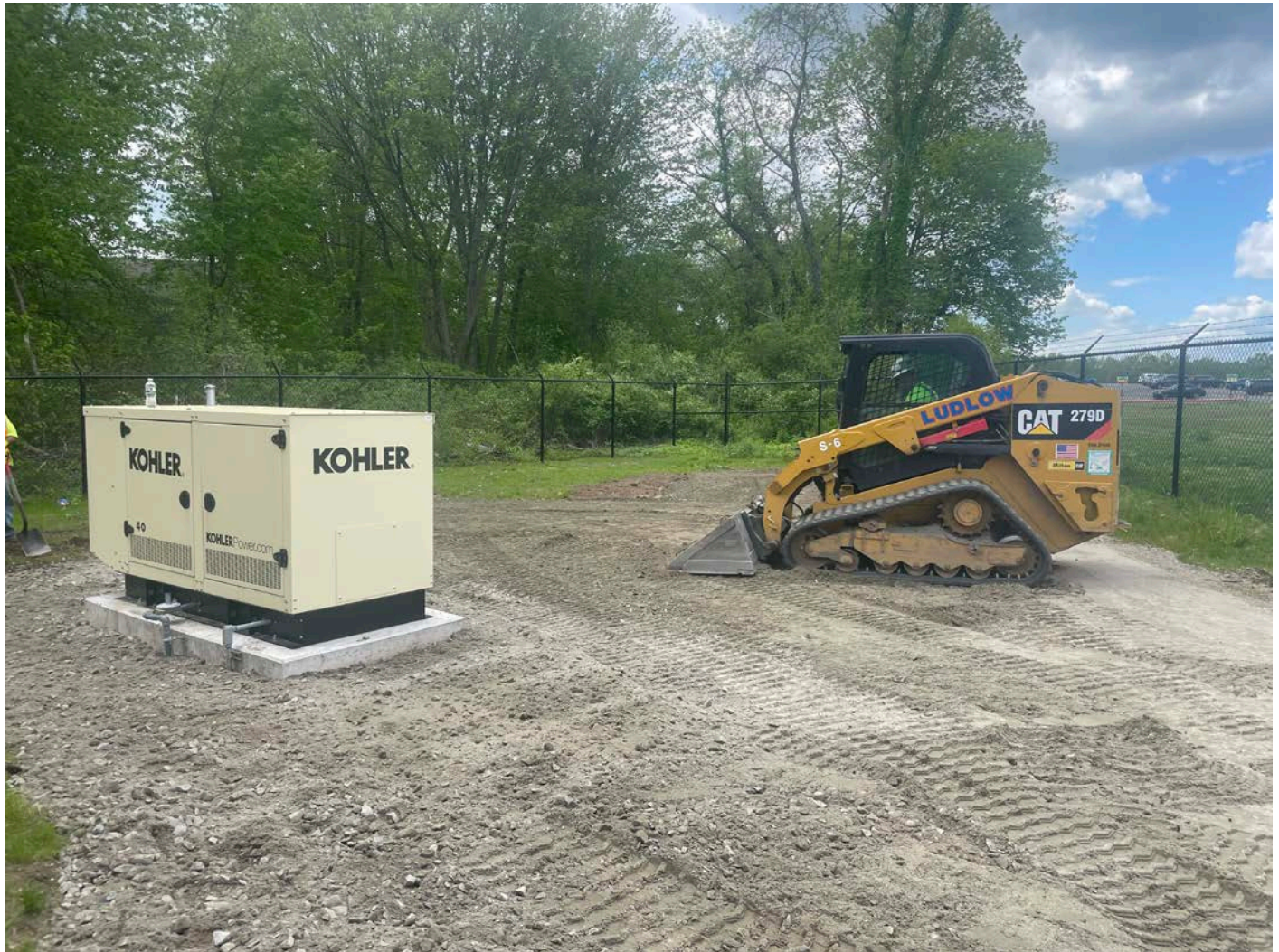
Picture 10: Ludlow grading the fill to the west of the Booster Station prior to paving. S. Main Street, Middletown; view to the west.