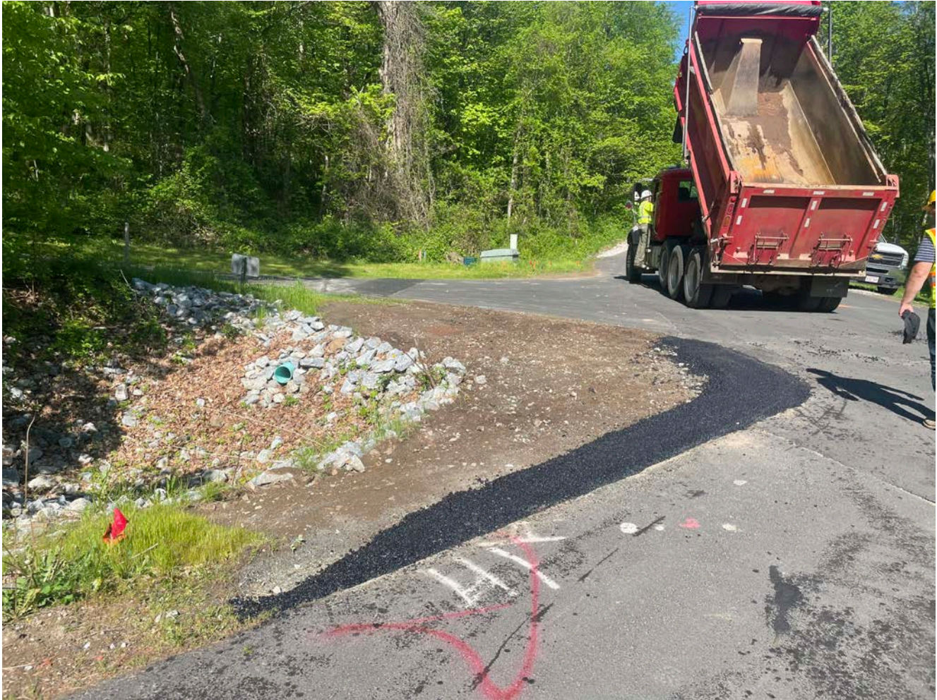
Picture 1: View of the peninsula of land located between the driveways for the 214 and 216 Talcott Ridge Drive properties where Ludlow excavated soil and placed additional asphalt. Shared Access Driveway in Middletown; view to the northwest.