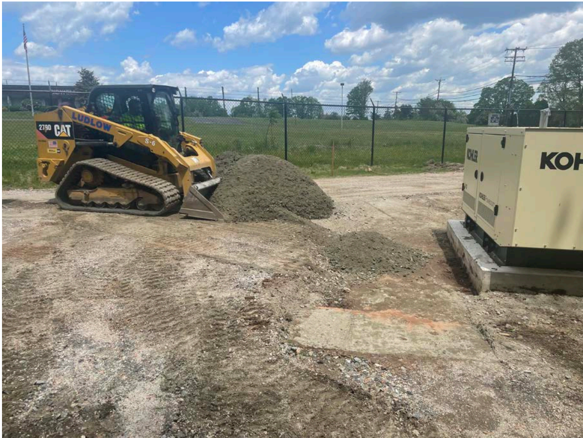
Picture 8: Ludlow placing -3" gravel around the concrete base of the generator located on the west side of the Booster Station. View to the northeast.