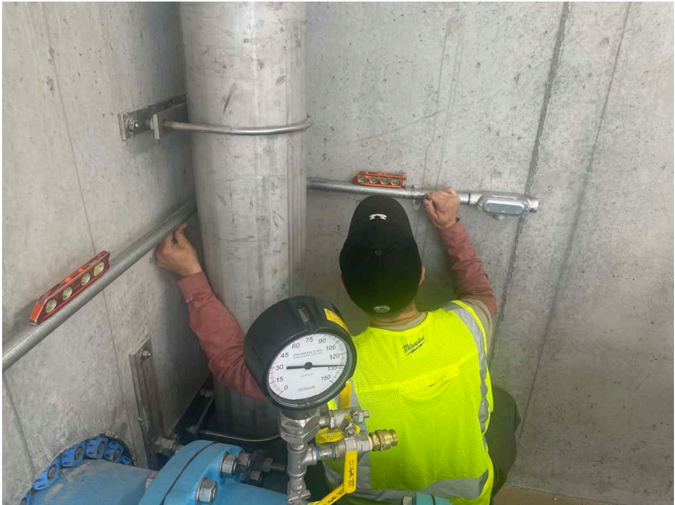
Picture 5: A&R Electrical installing 1" steel conduit on the inside of the PRV Vault located at Station 161+40 on Main Street, Durham. View to the northwest.