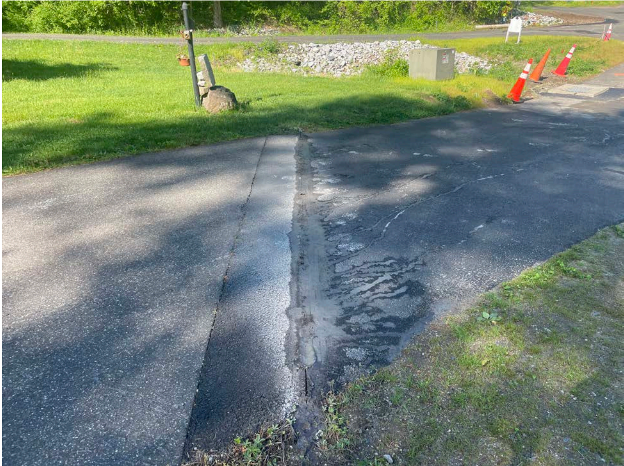
Picture 3: Transition between the driveway for the 224 Talcott Ridge Drive property and the Shared Access Driveway where Ludlow saw cut ahead of placing the final lift of asphalt. View to the east.