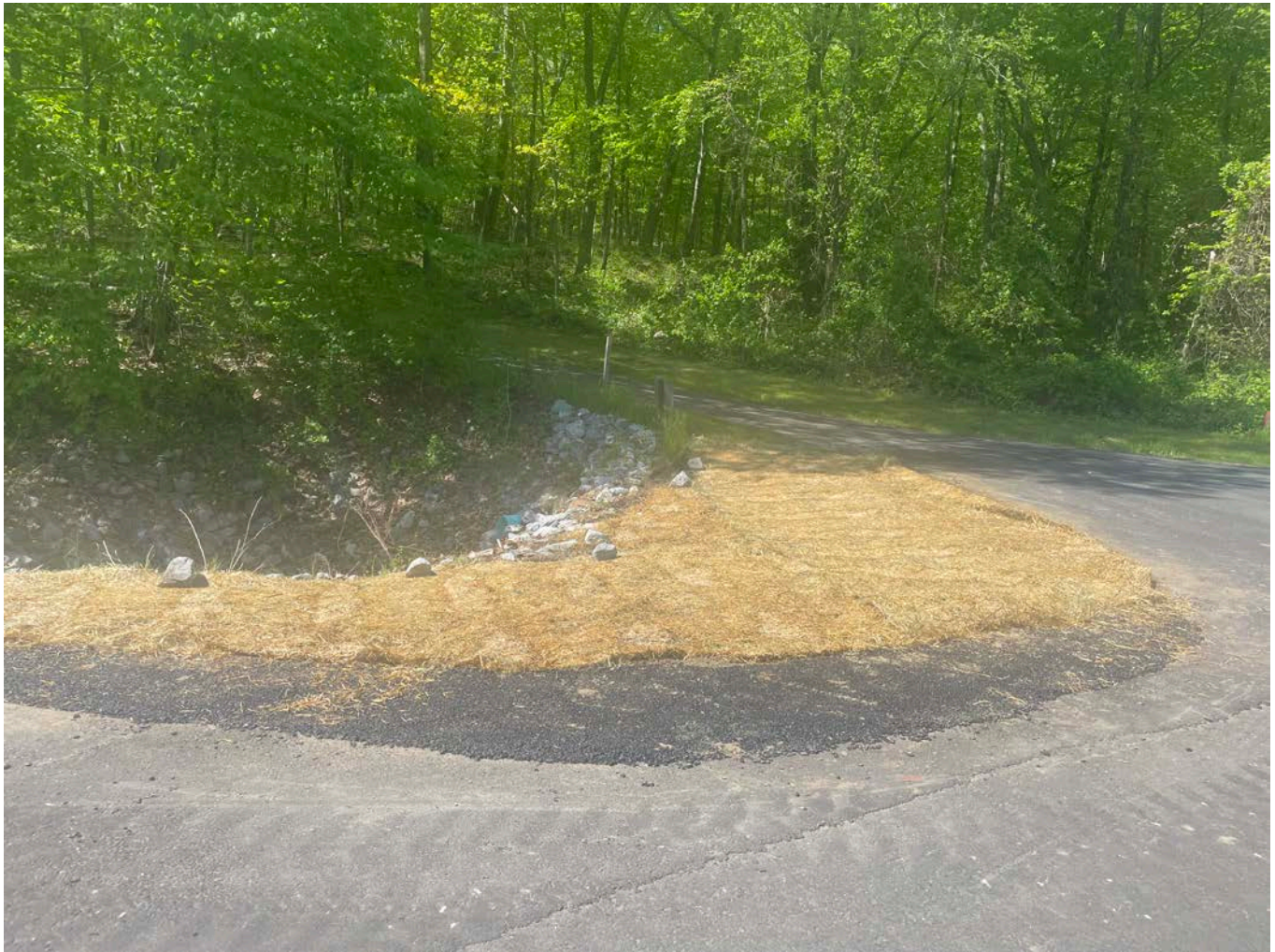
Picture 4: View of the peninsula of land located between the driveways for the 214 and 216 Talcott Ridge Drive properties where Ludlow placed additional asphalt and restored the land to the west with loam, grass seed, and straw. Shared Access Driveway in Middletown; view to the northwest.