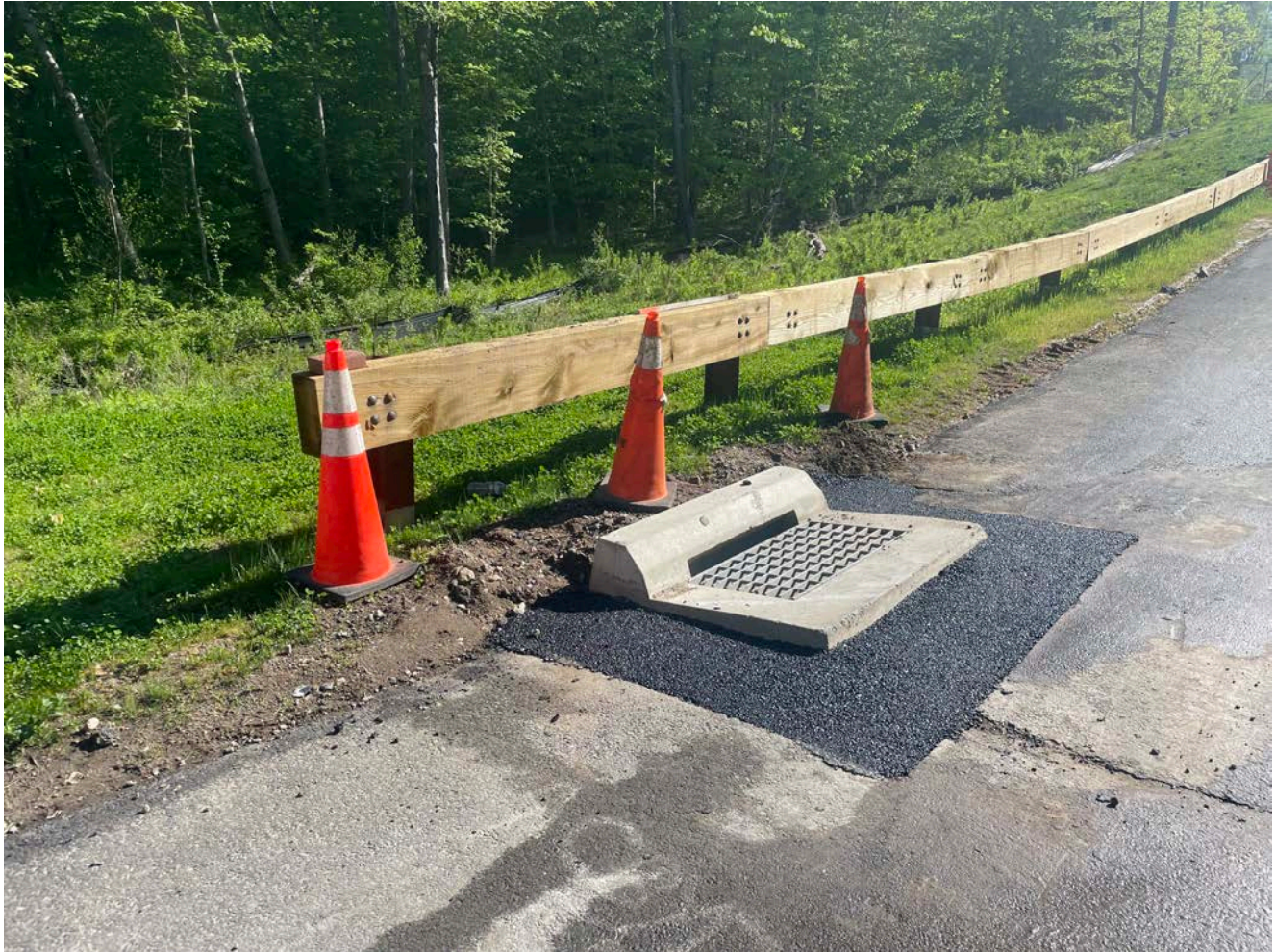
Picture 2: Catch basin located at ~Station 13+70 on the north side of the Shared Access Driveway where Ludlow placed asphalt. View to the northeast.