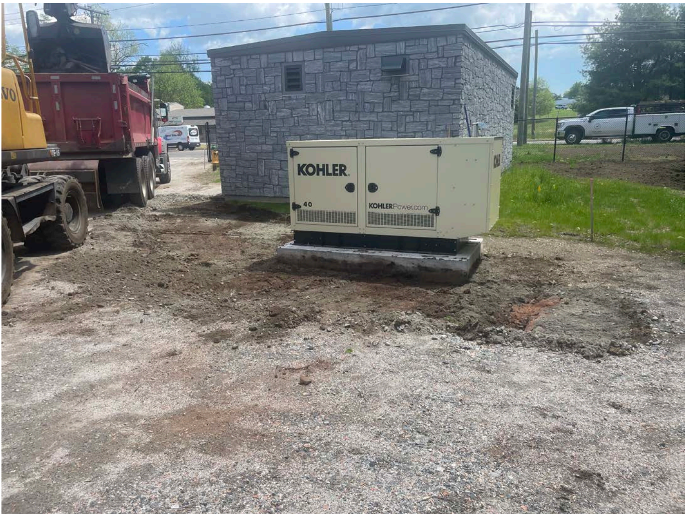
Picture 6: The west side of the Booster Station where Ludlow has removed fill from around the concrete base of the generator in order to backfill it with -3" gravel prior to paving. View to the east.